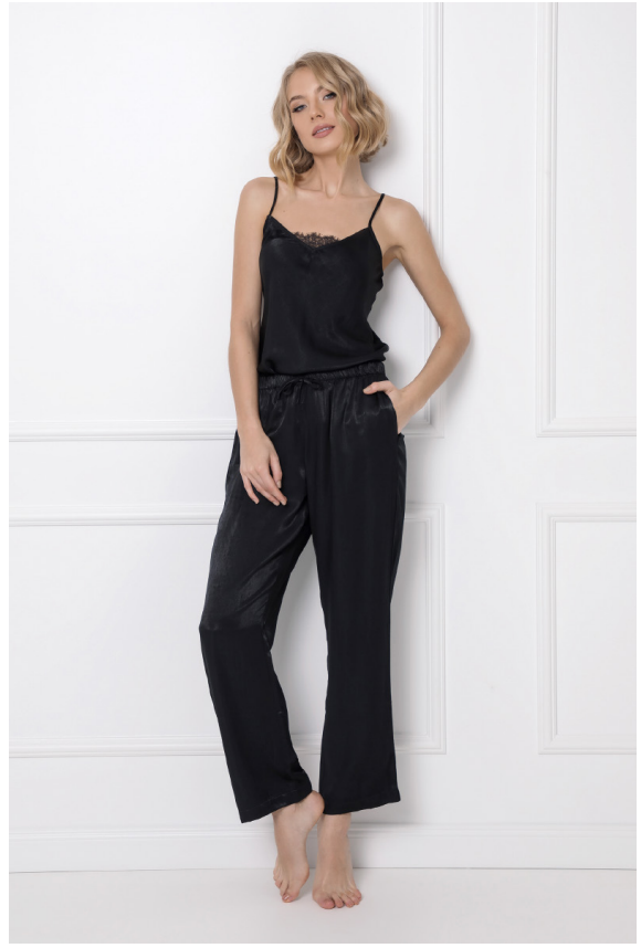
62% viscose 38% polyester