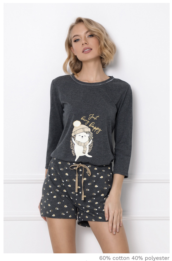
HANNA PAJAMA SHORT XS S M L XL