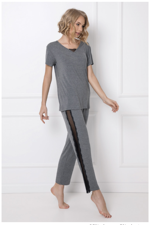
95% viscose 5% elastane