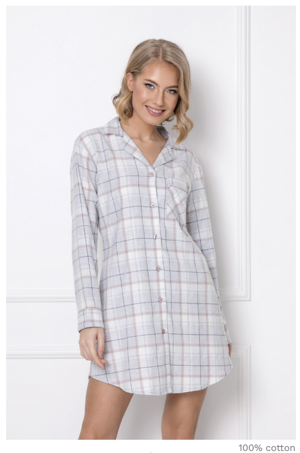
AMALIA NIGHTDRESS XS S M L XL XXL