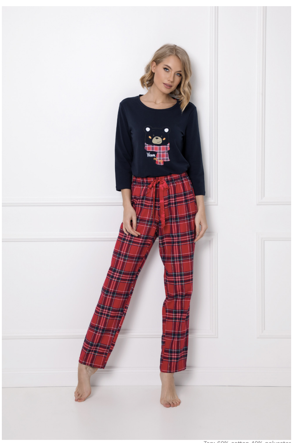
Top: 60% cotton 40% polyester Bottom: 100% cotton