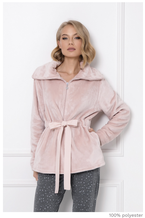
EVE JUMPER DUSTY PINK XS S M L XL