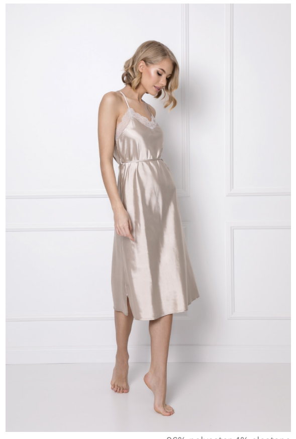
96% polyester 4% elastane