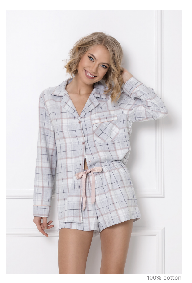
AMALIA PAJAMA SHORT XS S M L XL XXL