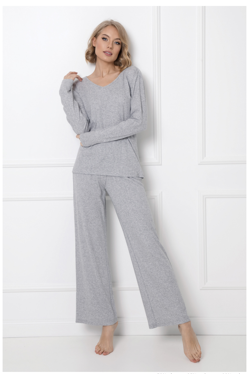
53% viscose 25% polyester 22% nylon