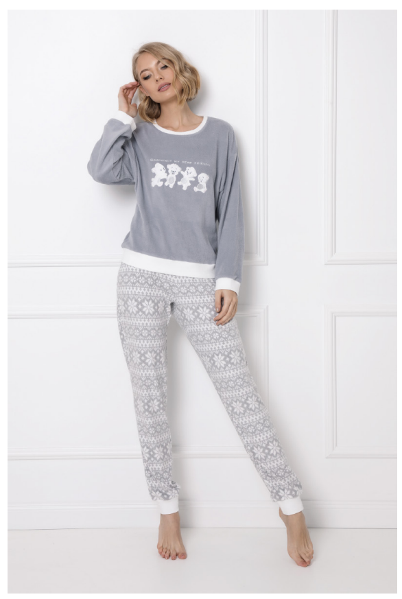
96% polyester 4% elastane