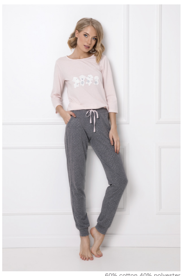
60% cotton 40% polyester