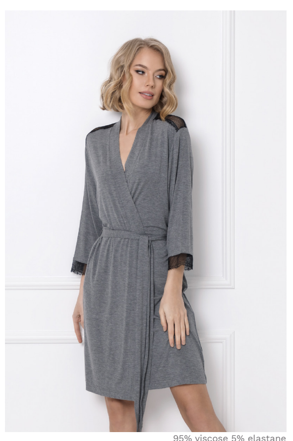
95% viscose 5% elastane