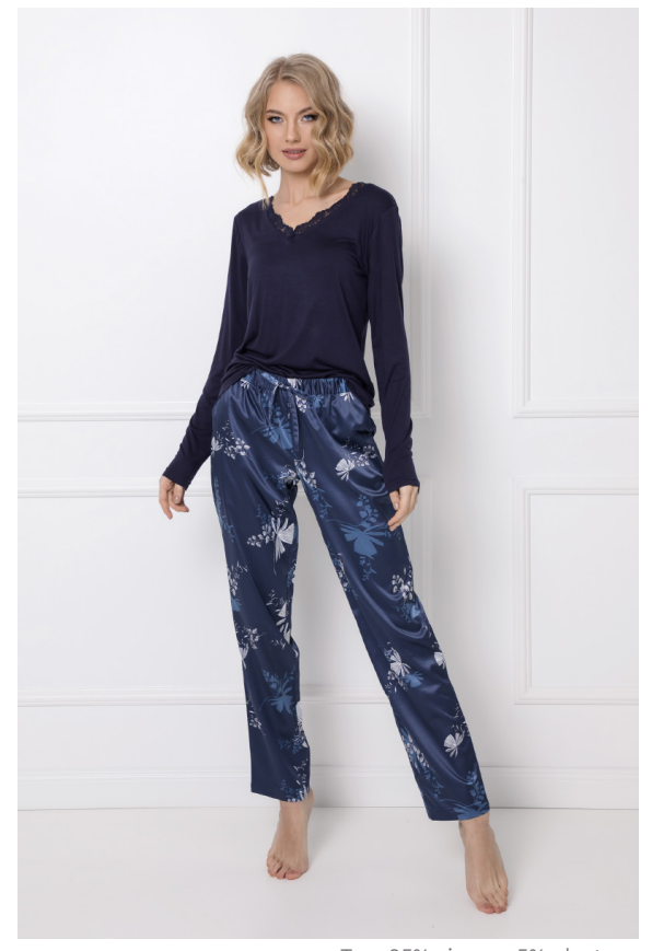
Top: 95% viscose 5% elastane Bottom: 96% polyester 4% elastane