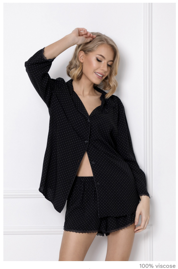
BERTHINE PAJAMA SHORT XS S M L XL XXL