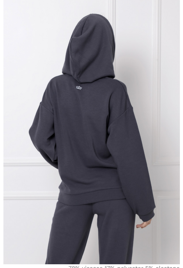
78% viscose 17% polyester 5% elastane