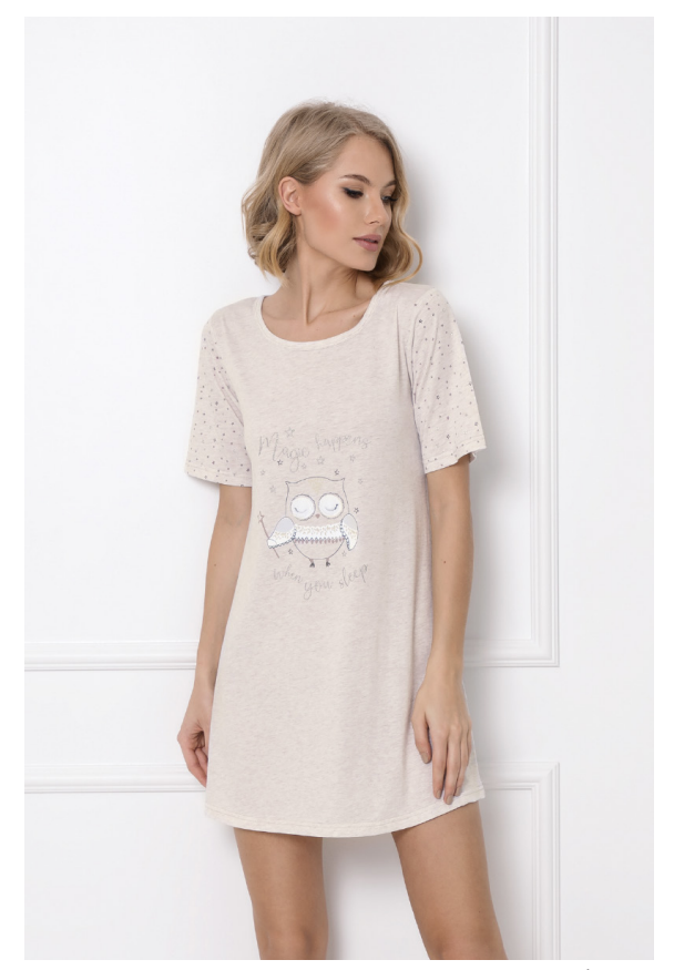
60% cotton 40% polyester