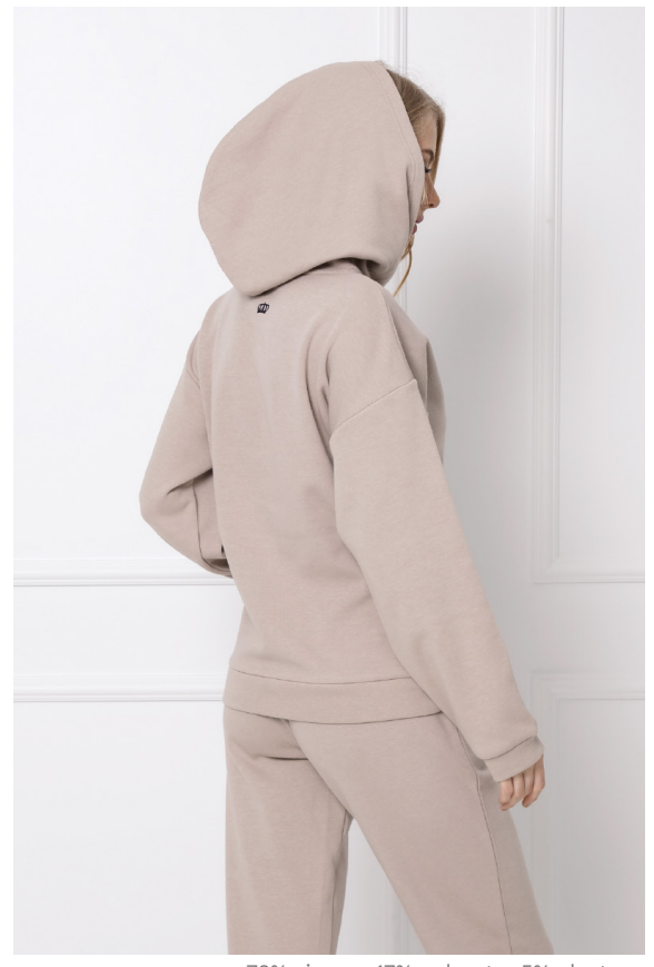
78% viscose 17% polyester 5% elastane