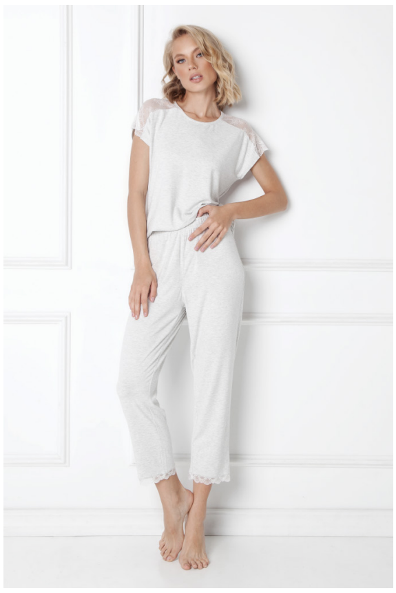
95% VISCOSE 5% ELASTANE