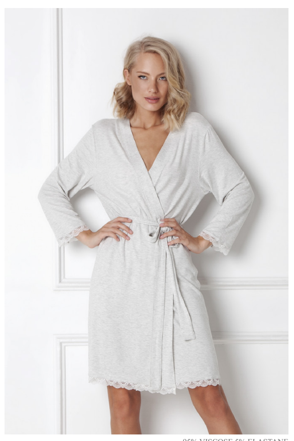
95% VISCOSE 5% ELASTANE