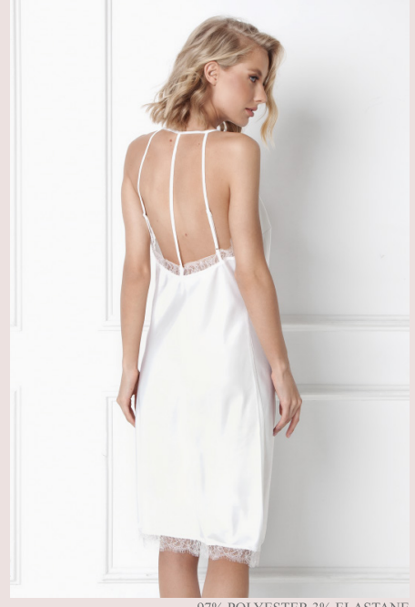
97% POLYESTER 3% ELASTANE