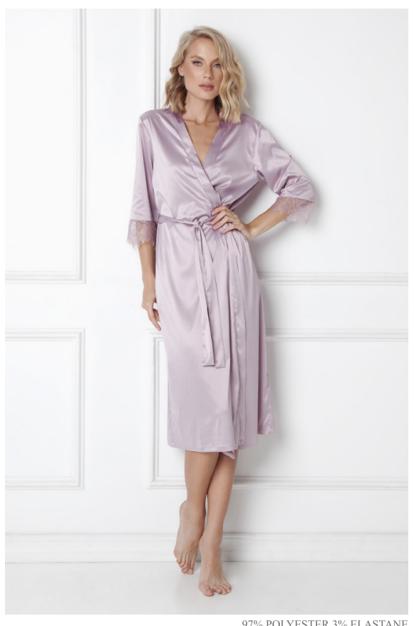
97% POLYESTER 3% ELASTANE