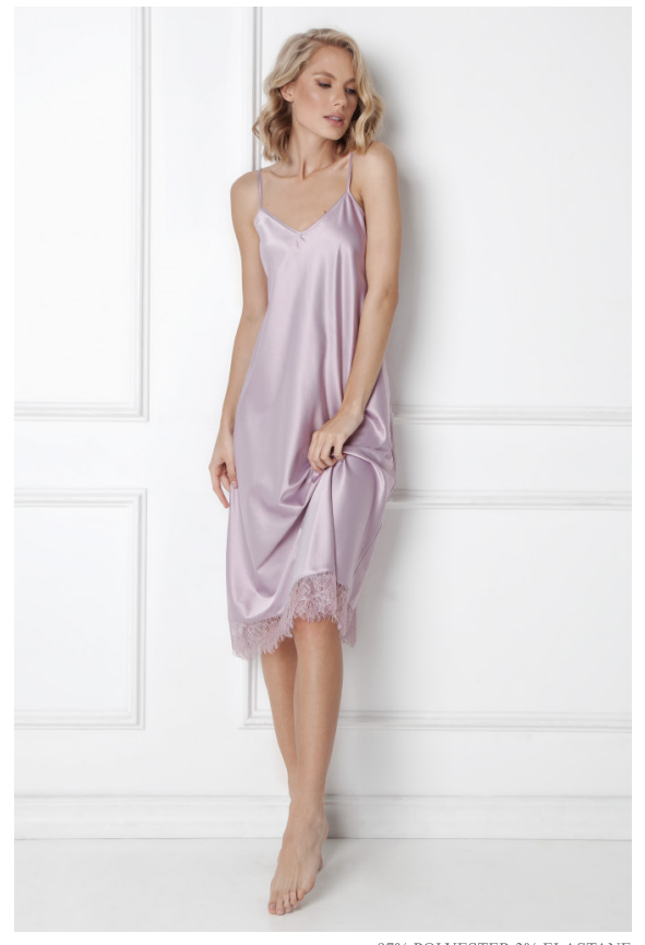
97% POLYESTER 3% ELASTANE