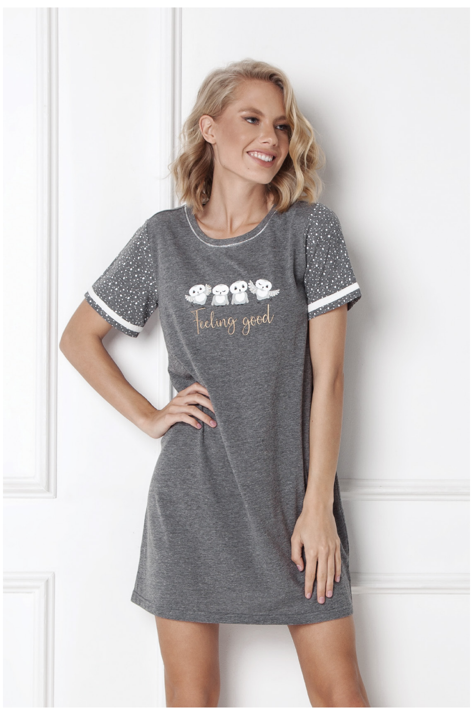
60% COTTON 40% POLYESTER