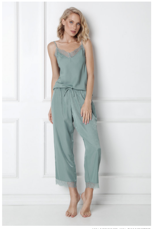
60% VISCOSE 40% POLYESTER